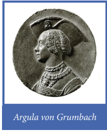
Argula von Grumbach

"I am prepared to lose everything, even life or limb. May God stand by me." So wrote Argula von Grumbach (1492–1563/68?) from Bavaria, who found Martin Luther's message of Christian freedom and equality empowering. This noble woman challenged an entire Catholic university in Ingolstadt in defense of Lutheran faith and a student persecuted for "Lutheran heresy." This