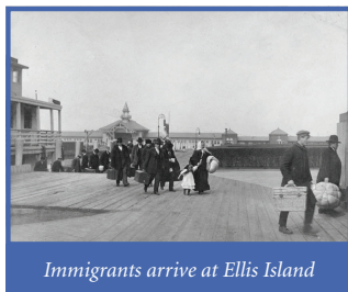
Immigrants arrive at Ellis Island

People, printing, and politics—all played a part in this process. Students from across Europe and Scandinavia, such as the Swedish brothers Olaus and Laurentius Petri, were drawn to Wittenberg. They participated in lively theological debates and were influenced by Luther and his colleagues. Returning home, these students carried new gospel insight and the movement for reform. They also carried books and soon were producing more, including translations of the Bible and Luther's works into their own languages. Lutheran ideas and practices were established and endured where those gained support from powerful persons, such as Christian III. Having witnessed Luther's defense at the Diet of Worms, he introduced Lutheran reforms in his duchy in the 1520s and then into the whole of his realm when he became king of Denmark.