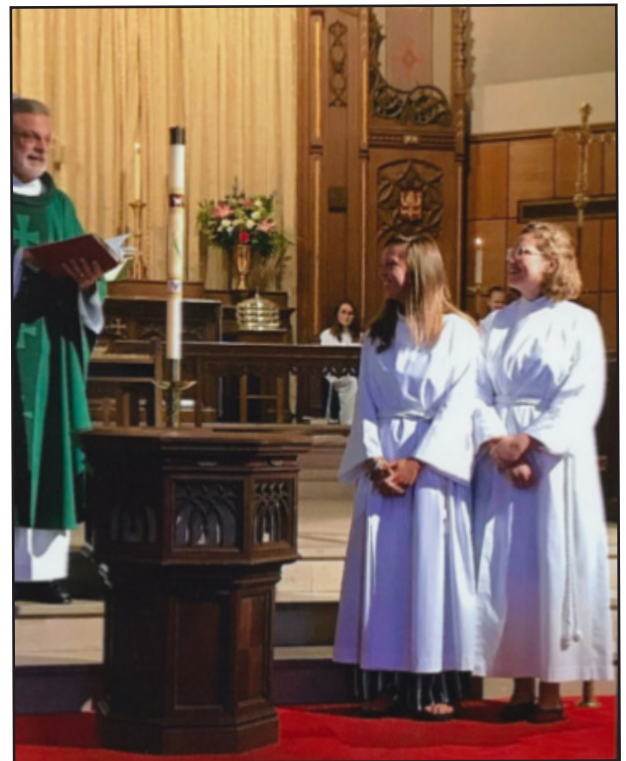
Sending of our Seminarians on August 11, 2019